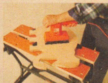
Swivel pegs hold odd shapes for finishing sanding.