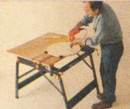
Holds irregularly shaped objects; centerboard behind jaws gives extra work surface.