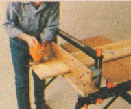
Clampdown jaw holds material for sawing.