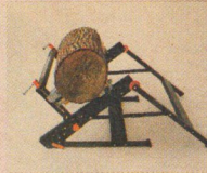
Fold one leg and WORKMATE® becomes a sturdy sawhorse.

E—79-025 WORKMATE® Benchtop Work Center & Vise. HOBBYCRAFTER 8". Makes lightweight projects, painting, crafts, soldering easier than ever! Attaches to work surfaces to 2 1/2" thick. 8" vise jaws open to 3". Swivel pegs hold odd shapes to 5 1/4". Work surface tilts from 0° to 45° forward, up to 30° to left or right, and pivots a full 360°. Holds pipe, tubing, wedge shapes. Alligator clips hold wires for soldering, small materials for painting. Includes both soft vinyl and metal vise jaw covers. 2 1/2 lbs. net wt.