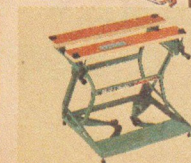
WORKMATE® folded to sawhorse position.