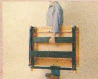
Folds for compact storing, easy carrying. Take it to the job.