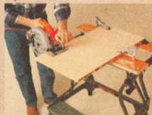
79-016 Clamps hold plywood securely for sawing.