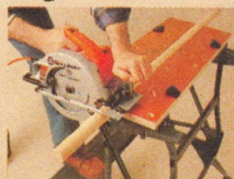
V-grooves in vise jaws hold round objects.