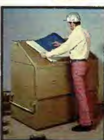
During the day use pull-down door as desk top on job site

ORDER INFO: Pay motor carrier charges from factory in Pochontas, Ar allow time; no C.O.D.'s. Assembled. F9 HT 65241N—Shipping weight 278 pounds . . . $229 99