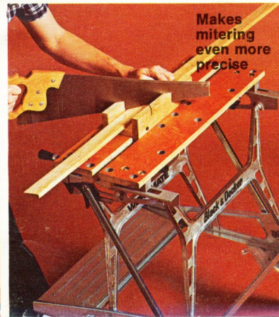
Makes mitering even more precise