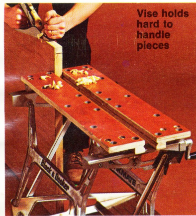
Vise holds hard to handle pieces