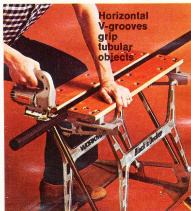
Horizontal V-grooves grip tubular objects