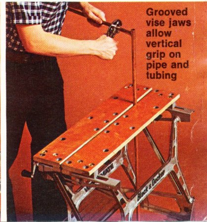
Grooved vise jaws allow vertical grip on pipe and tubing