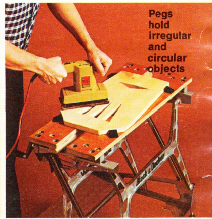
Pegs hold irregular and circular objects