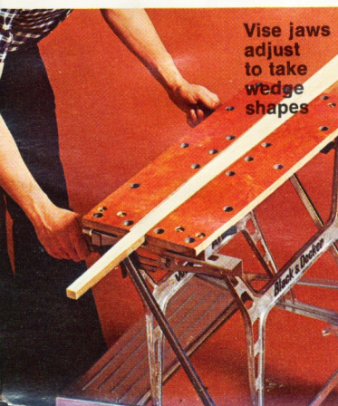
Vise jaws adjust to take wedge shapes